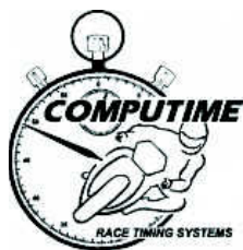
Clerk of Course - Paul Cansdale

Computime Race Timing Systems Pty Ltd © 1996-2008